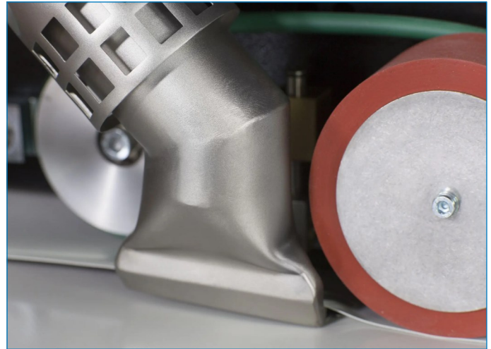
Heating nozzle and pressure wheel detail

Forsthoff P-2 Overlap Welder - the efficient and maneuverable hot air automatic welding machine for the truck tarpaulin and advertising banner manufacturers.